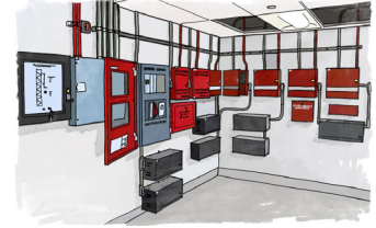
More Demand for Systems & Services